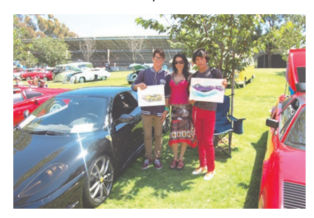
Winners of the Design Your Dream Car contest

In addition to showcasing their work, students learn the importance of deadlines.