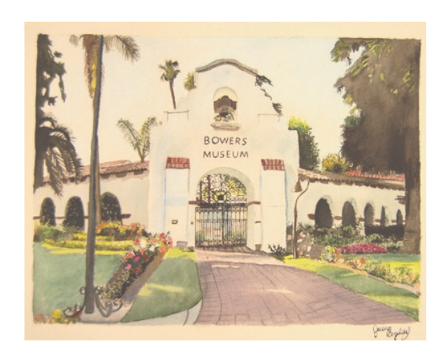
SAUSD Artspiration Best in Show

This concentration culminates in a student portfolio of work that is submitted to the College Board.